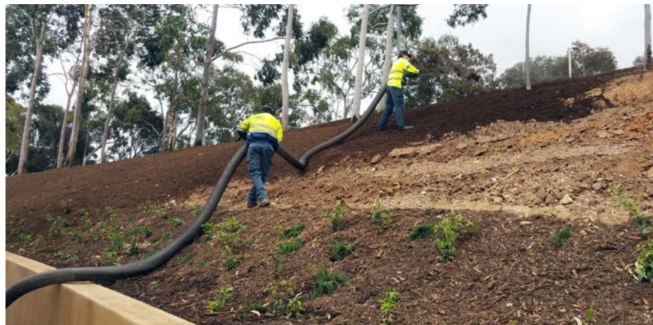
Jeffries PowerScaper can install up to 2000 m3 per day with up to 100m of hose.