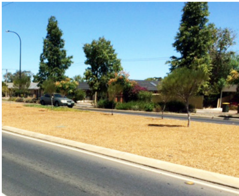
Jeffries PowerScaper can install up to 2000 m 3 per day with up to 100m of hose.