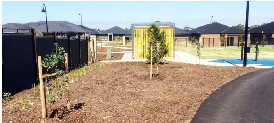
Jeffries PowerScaper can install up to 2000 m3 per day with up to 100m of hose.