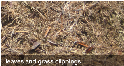
leaves and grass clippings