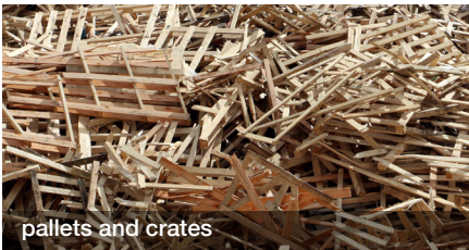
pallets and crates