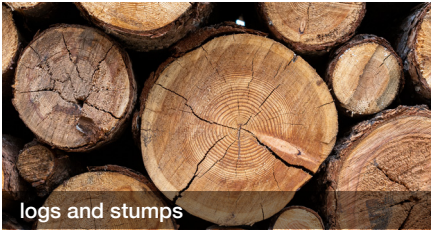
logs and stumps