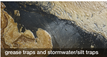
grease traps and stormwater/silt traps