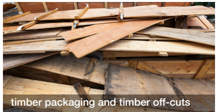
timber packaging and timber off-cuts